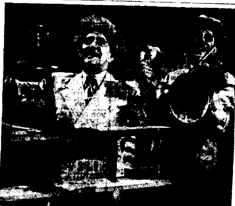
of "Hellzapoppin'" and "Sons O'Fun," have invented new laugh-gags and gaudies for their latest comedy riot, "Crazy House," opening Saturday at the Lyric theatre.