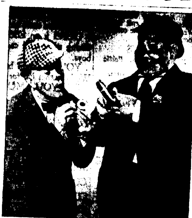
DOPEY DICKS —Laurel and Hardy, the devastating duo of dopey dicks in "The Big Noise," which is playing at the Quina theatre, follow a hot clue and come to the monumental discovery that where there's smoke there's fire. In the hilarious 20th Century-Fox hit, the shivery Sherlock mix blondes with bombs setting off the year's biggest blowout of fun and laughter. Featured in the cast are Boris Merrick, Arthur Space and Veda Ann Borg.

THEY SPEAK A LANGUAGE SIMILAR TO THE TARTARS