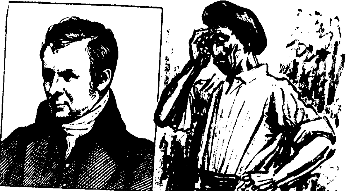
SIR HUMPHRY DAVY Inventor of the MINER'S SAFETY LAMP COULD RECITE "PILGRIM'S PROGRESS" BEFORE HE WAS OLD ENOUGH TO READ IT.