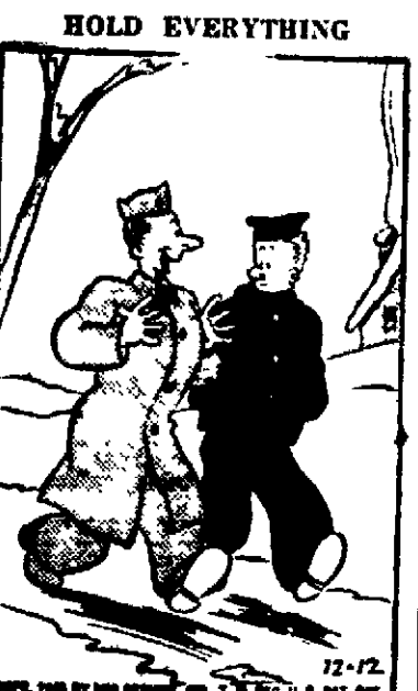
"We've got to be good—there's a fellow in our outfit who writes history books!"

The loudest noise the world has ever heard is believed to have been the eruption of the volcano Krakatoa in 1883, heard 3,000 miles away.