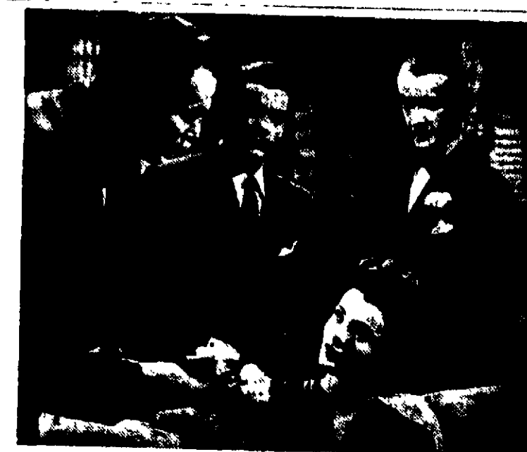
STAR ON QUILNA SCREEN—Gene Tierney and Dana Andrews are starred in "Laura," the taut and suspenseful psychological drama of romance and murder now playing at the Quilna theatre. In the thrilling film, Miss Tierney, in the top role of her career, appears as "Laura," loved by all men. . . loving none; Andrews is seen as Mark who was her in a moment of terror. Clifton Webb, celebrated star of the Broadway stage, makes his film debut in the picture which also features Vincent Price and Judith Anderson.