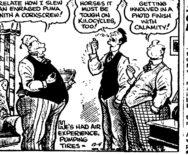
OUR BOARDING HOUSE WITH MAJOR HOOPLE