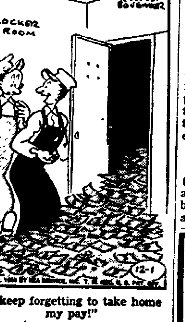
"I keep forgetting to take home my pay!"