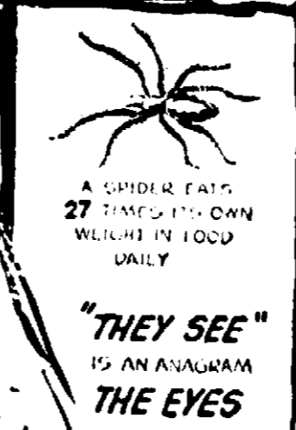
A SPIDER EATS 27 TIMES ITS OWN WEIGHT IN FOOD DAILY "THEY SEE" IS AN ANAGRAM OF THE EYES