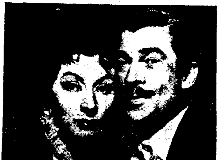
STARS IN OHIO PICTURE—Greer Garson and Walter Pidgeon are co-starring in "Mrs. Parkington," Louis Bromfield's thrilling romantic novel, with Edward Arnold, now showing at the Ohio theatre.