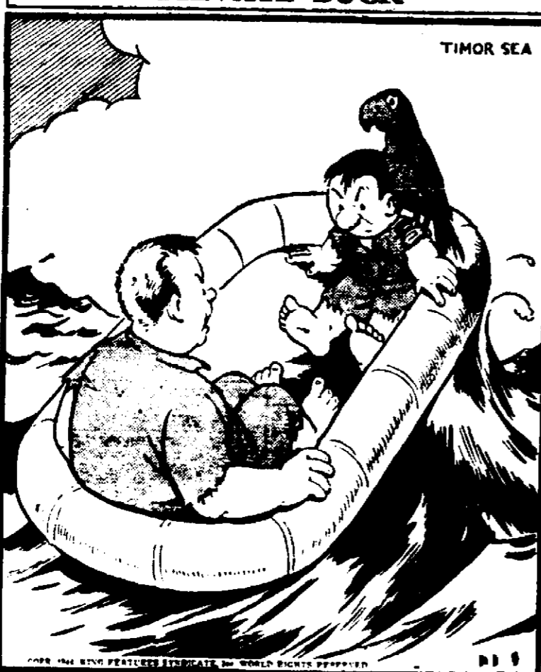
"Not only could we eat, Buck, but we wouldn't be reminded of crackers any more!"

MIDNITE LYRIC Show 11:30 Tonite TOM TYLER SANTA FE BOUND