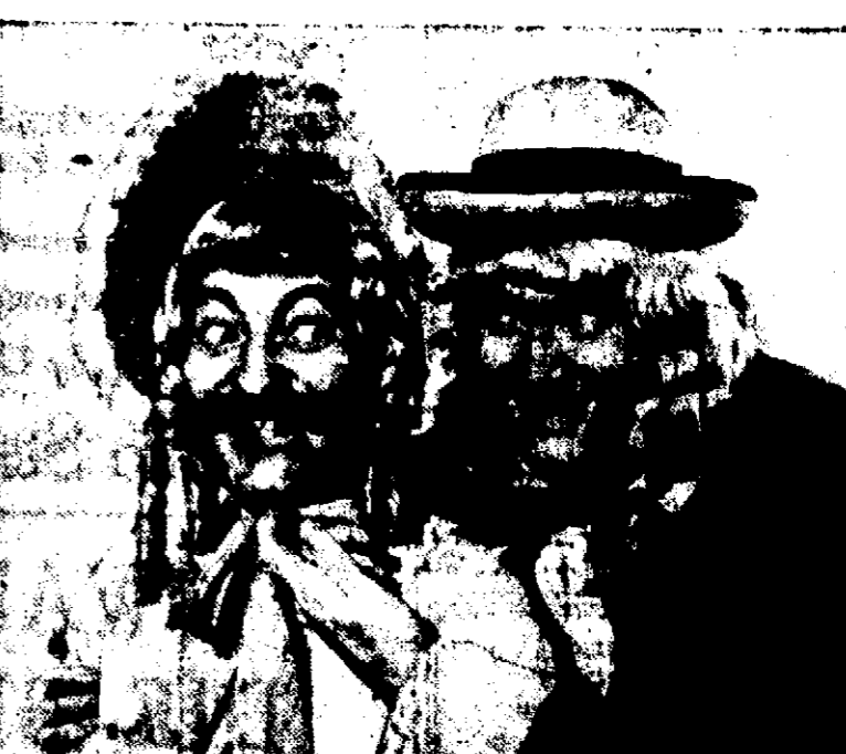
MUSICAL HIT AT QUILNA—Jerry Colonna and Paul Whiteman, in a hilarious scene from "Atlantic City," spectacular new musical hit now showing at the Quilna theatre.