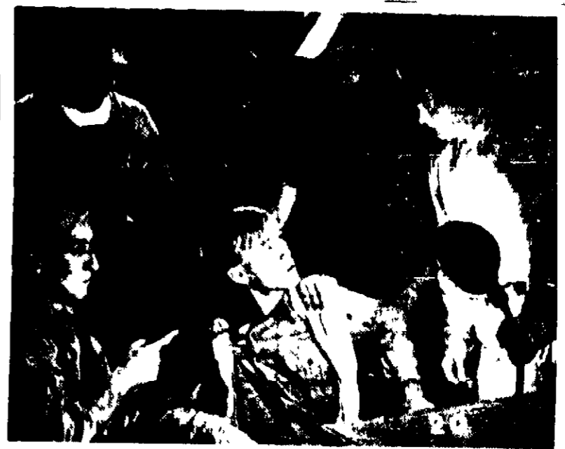
HOME MADE THIRD DEGREE—Foreground, left to right, Huntz Hall, Billy Benedict and Leo Gorcey are shown in a scene from the exciting comedy-drama "Follow the Leader." East Side Kids star now playing at the Quilna.