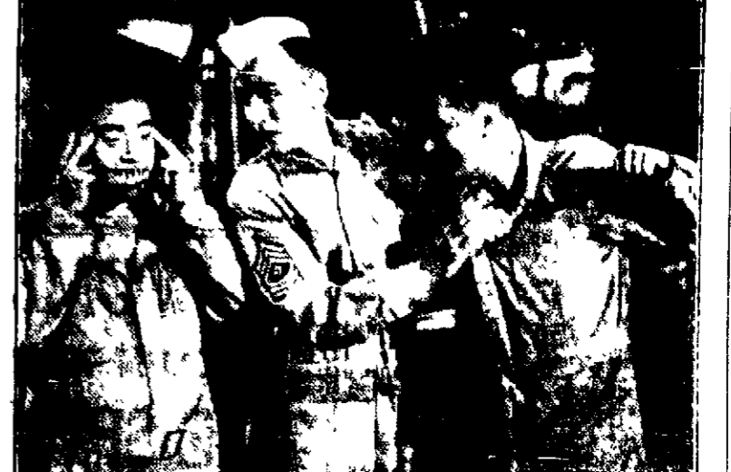
AT LYRIC—Uncommon are such sights as these, but all are in good fun. "Rookies in Burma" is a movie which is believed to top all the hilarious shows on record. It opens at the Lyric theatre Saturday midnight.