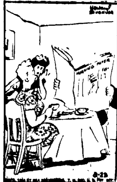
"He never reads, ma'am—he keeps making faces at you!"