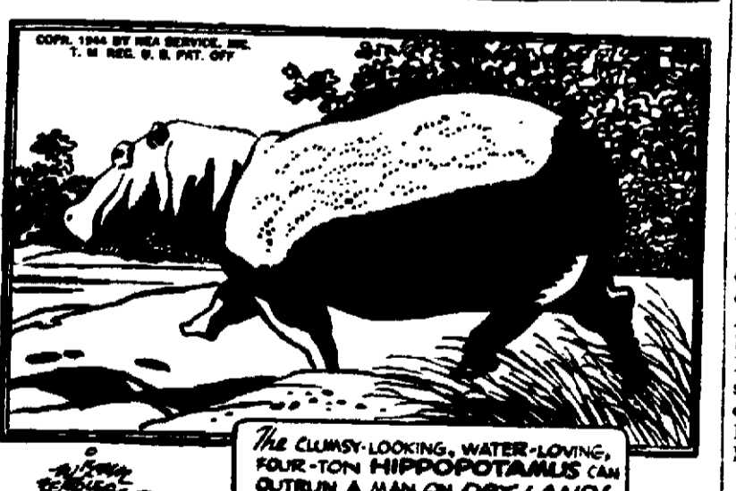
The clumsy-looking, water-loving, four-ton hippopotamus can outrun a man on dry land!