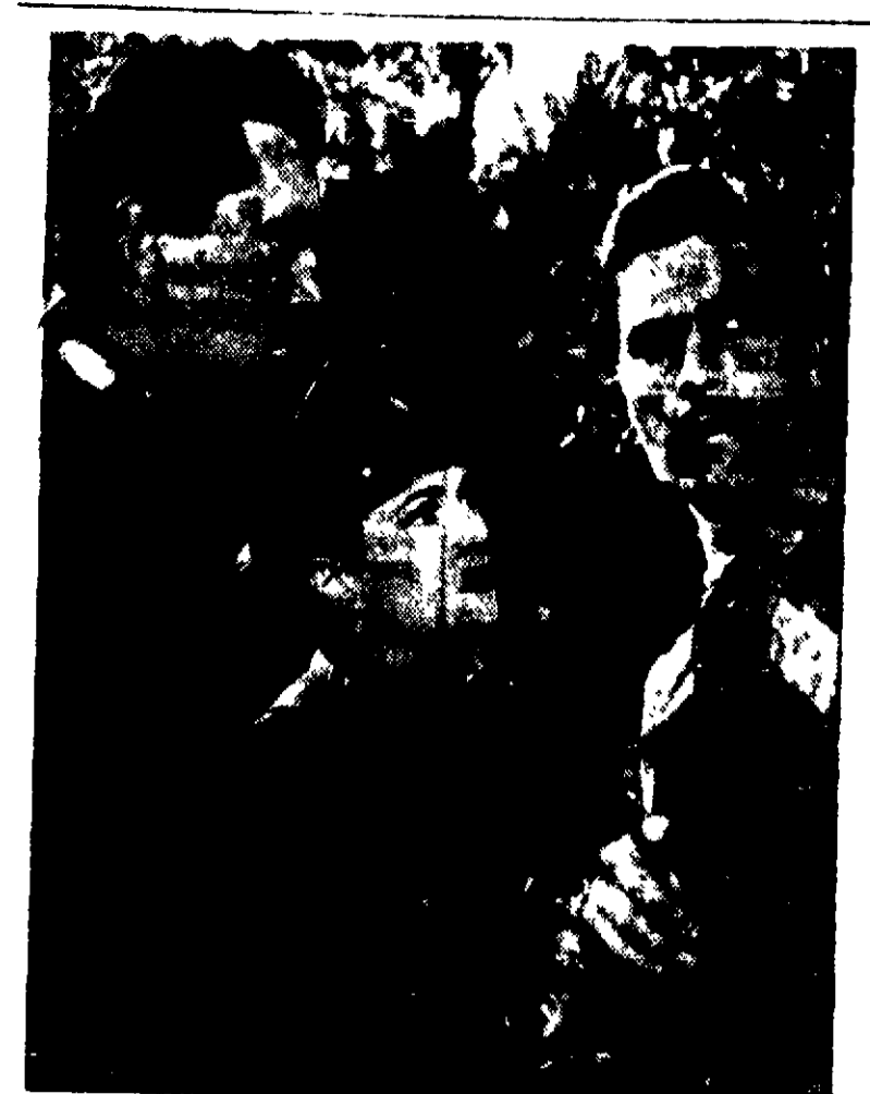
HOPEFUL —Cornered, this courageous threesome refuses to give up their hope of escape from the clutches of the Nazis in the suspenseful new action film, "Bomber's Moon." Stated Monday for the Lyric theatre, the film stars Annabella and George Montgomery (right) while Kent Taylor accompanies them in their flight for freedom.