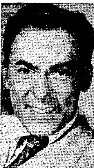
WOODY HERMAN WBBM at 7

7 p. m.—Allan Jones (WBBM): Woody Herman's orchestra, songs by Allan Jones, interviews with G.I.'s here and abroad.