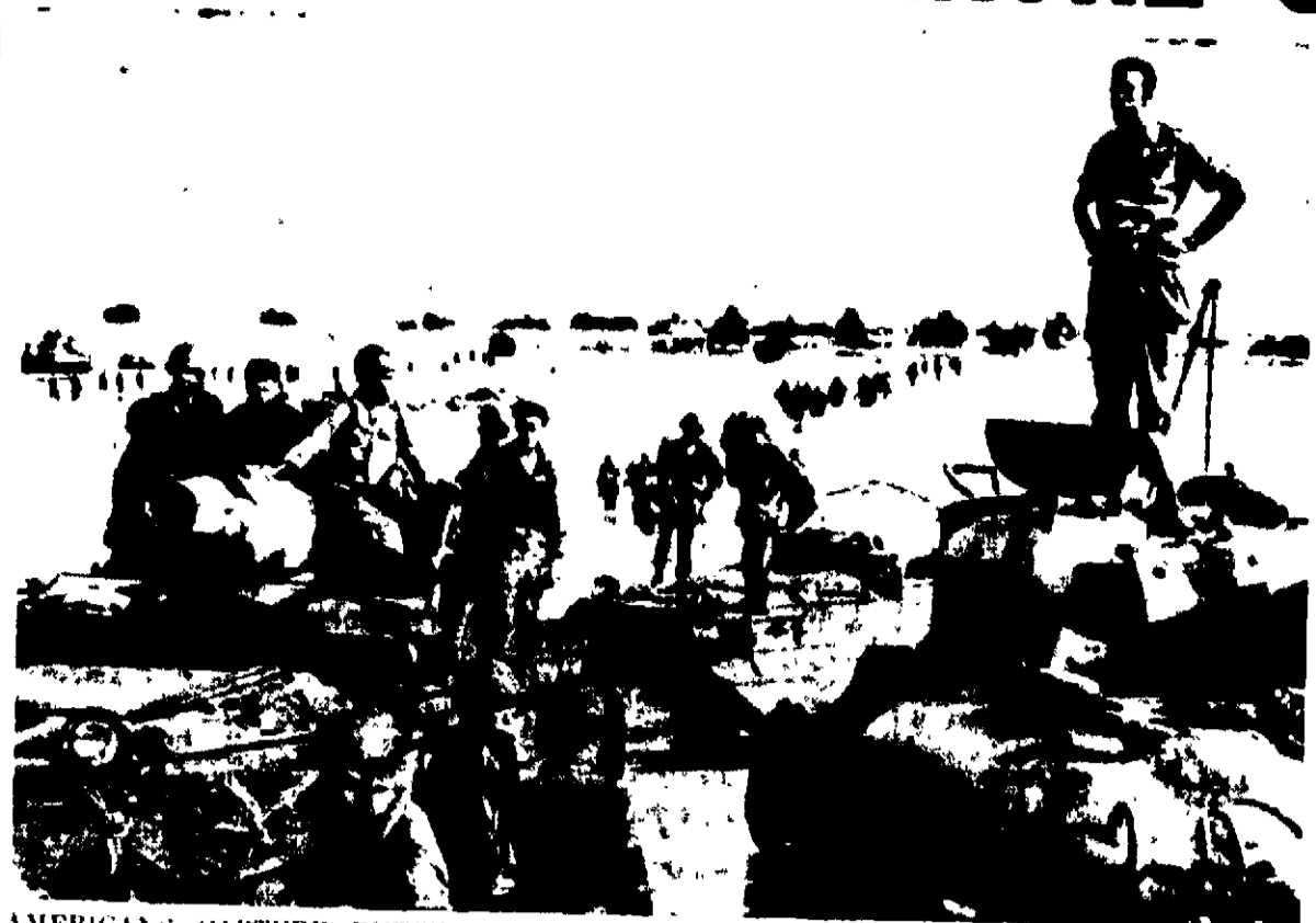
AMERICANS CAPTURE DUTCH NEW GUINEA ISLAND—U. S. troops coming ashore on Noemfoor island off the coast of Dutch New Guinea July 2 where they quickly smashed the Jap garrison wading thru coral reef in the rear.