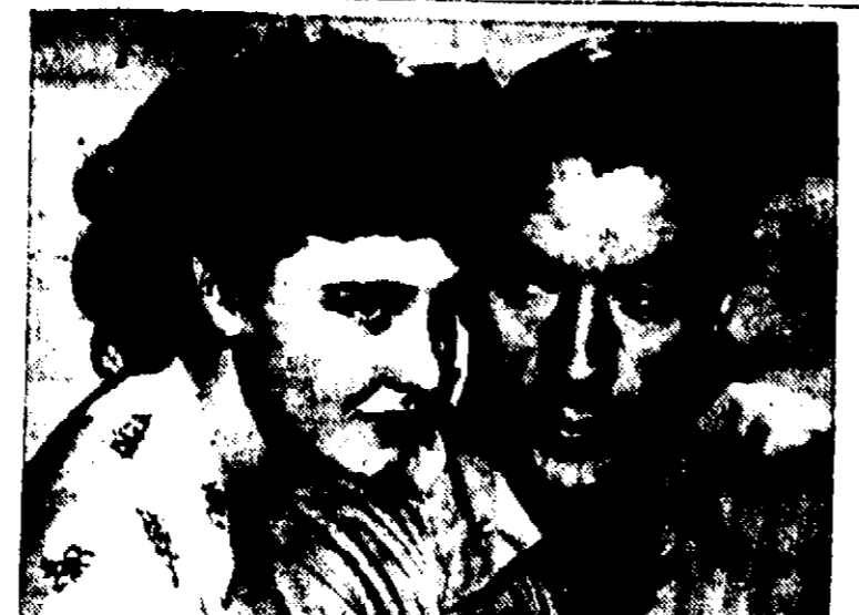
STARS IN OHIO FILM—Laraine Day and Gary Cooper, starred in "The Story of Dr. Wassell," the new Technicolor epic of a country doctor at the front, opening Friday at the Ohio.