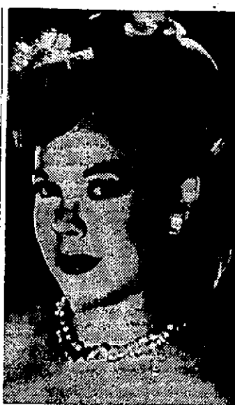
JOAN EDWARDS WBBM at 9:30