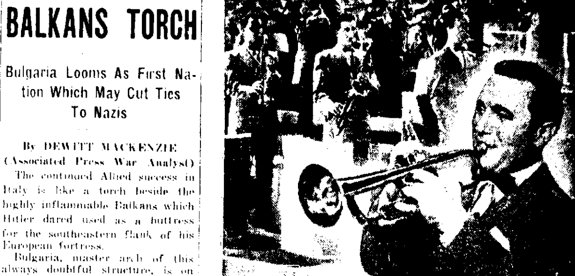
SWEET HORN—It's Charlie Spivak (the man who blows "the sweetest horn this side of heaven") and his orchestra who furnish the scintillating musical embellishments to "Pin Up Girl," dazzling new Technicolor musical, starring Betty Grable at the Quilna theatre. Also featured in the gay extravaganza are Martha Raye, Joe E. Brown, Eugene Pallette and the Skating Vanities.