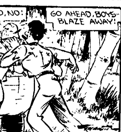
GO AHEAD, BOYS—BLAZE AWAY!