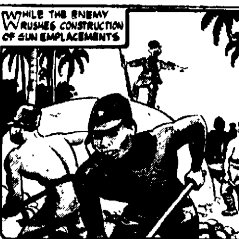
WHILE THE ENEMY WRUSHES CONSTRUCTION OF SUN EMPLACEMENTS