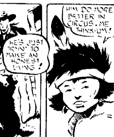
WHY DO MORE BROTHERS IN CIRCUS, RE THINK—UM!