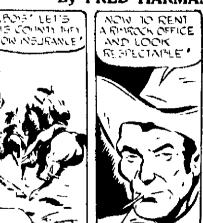
LET GOVERNMENT SHOW THIS COUNTRY THEY NEED COIN INSURANCE!