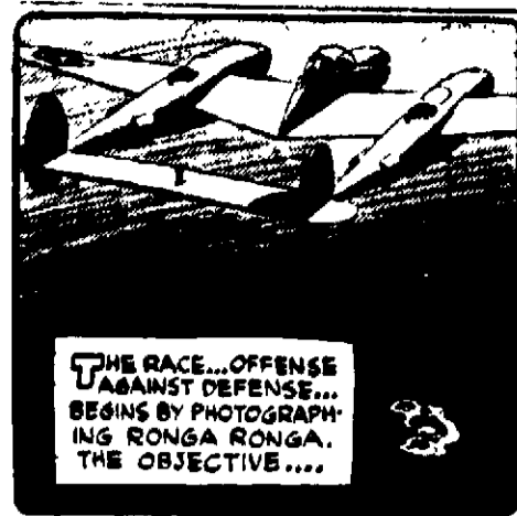
THE RACE...OFFENSE AGAINST DEFENSE... BEGINS BY PHOTOGRAPHING RONGA RONGA... THE OBJECTIVE....