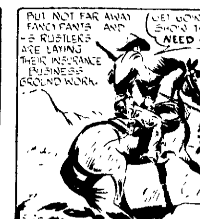
PUT NOT FAR AWAY FANCY PANTS AND FUSTLETS ARE LAYING THEIR INSURANCE BUSINESS GROUND WORK.