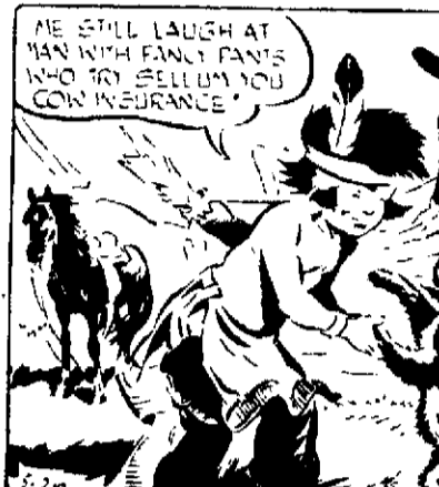
HE STILL LAUGH AT MAN WITH FANCY PANTS WHO TRY SELLING YOU COIN INSURANCE!