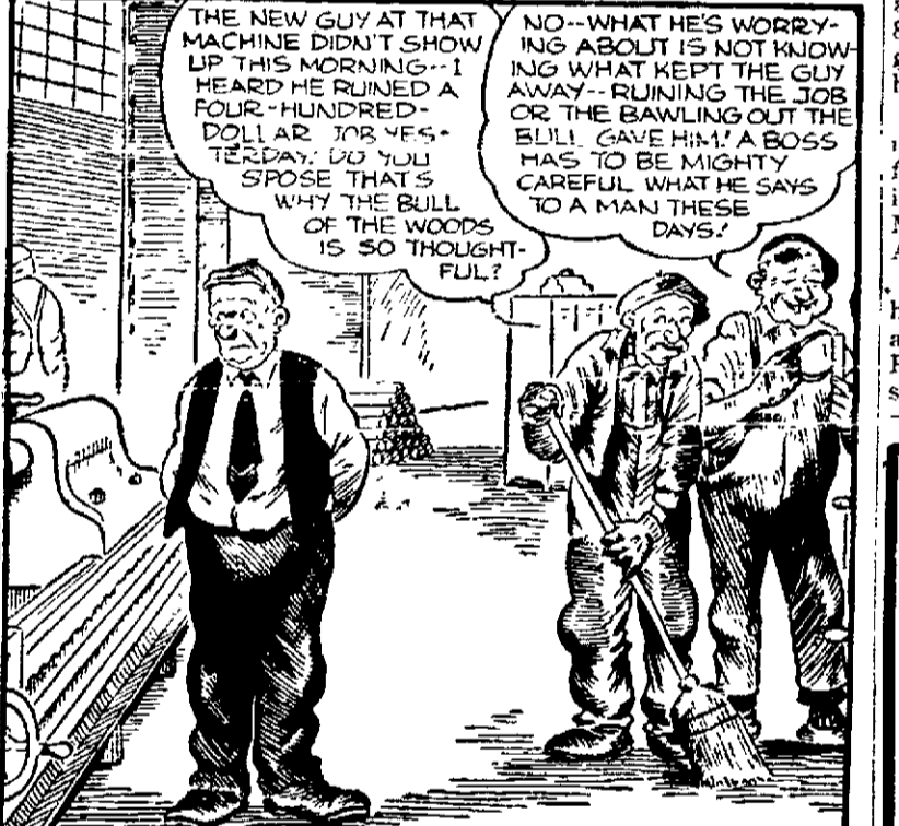
THE NEW GUY AT THAT MACHINE DIDN'T SHOW UP THIS MORNING—I HEARD HE HAD A FOUR-HUNDRED-DOLLAR JOB YES—TODAY. DO YOU SPOUSE THAT'S WHY THE BULL IS SO THOUGHTFUL?