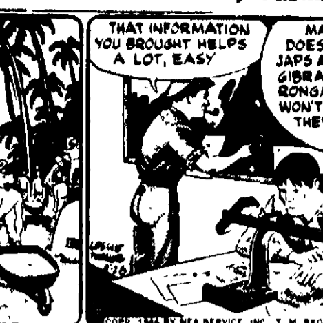
THAT INFORMATION YOU BROUGHT HELPS A LOT, EASY