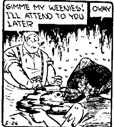
GIMME MY WEENIES! I'LL ATTEND TO YOU LATER