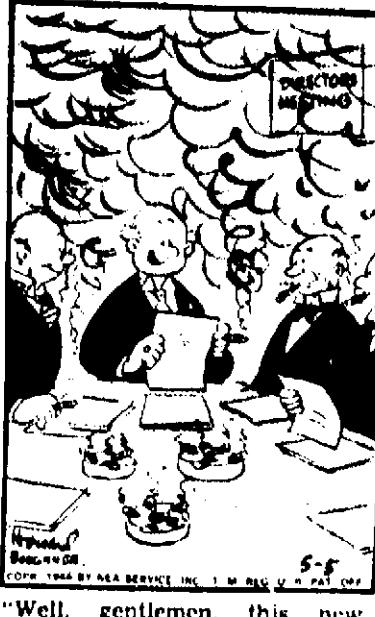
"Well, gentlemen, this new agreement has cleared the air, hasn't it?"