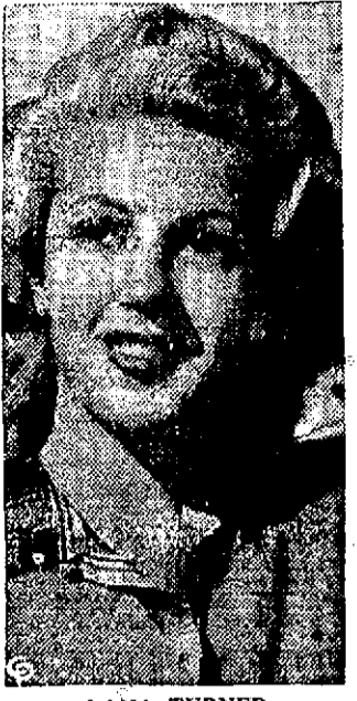
LANA TURNER WBBM at 8