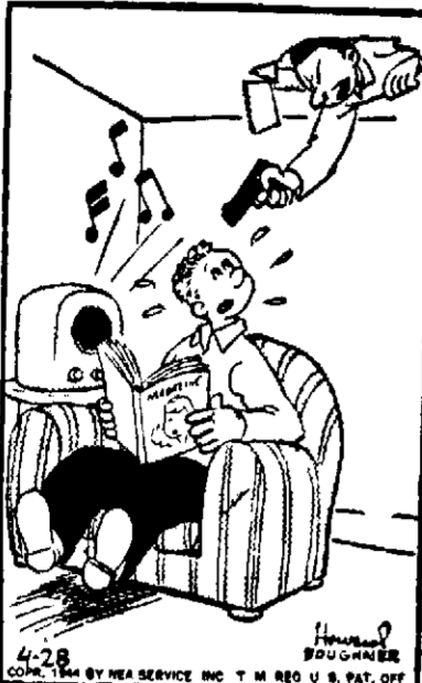
"For the last time, turn that radio down!"