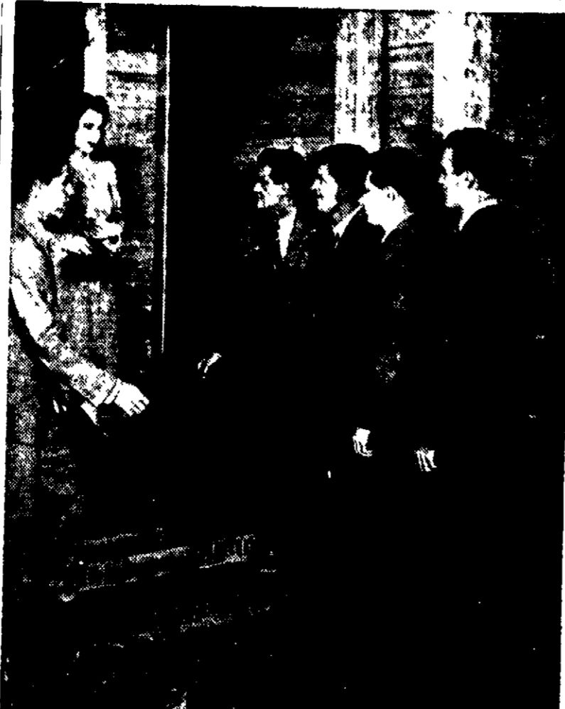
FAMILY AFFAIR—When one Sullivan falls in love, all the Sullivans follow suit in the production of "The Sullivans," the heart-warming story of the lives of the five famous brothers whose loyalty to each other and their country stirred the nation.

coat Larceny" and "Keeper of the Flame" as a co-billing.