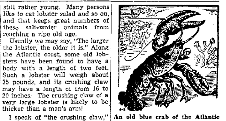
An old blue crab of the Atlantic

may fake part in a battle. During in the act of crawling on the sand large as the one which is lost.