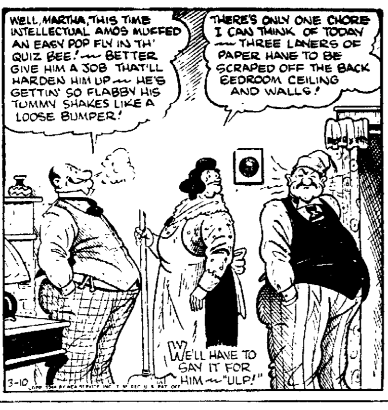
BOOTS AND HER BUDDIES—SO!