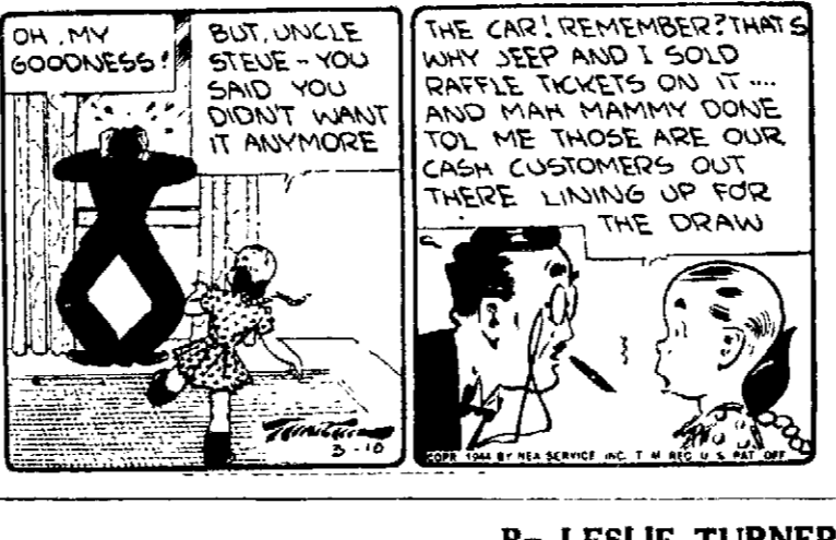
BY LESLIE TURNER