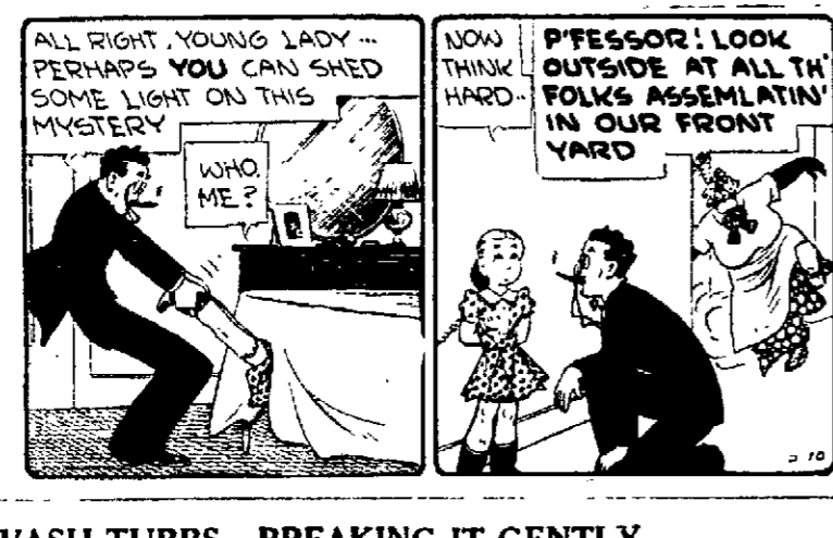
WASH TUBS—BREAKING IT GENTLY—