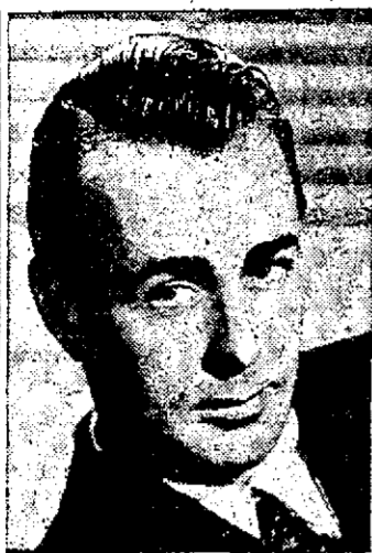
ALAN LADD WBBM at 8

6:30 p. m.—American Melody Hour (WBBM): "Love Has Made This Such a Lovely Day," "I Couldn't"