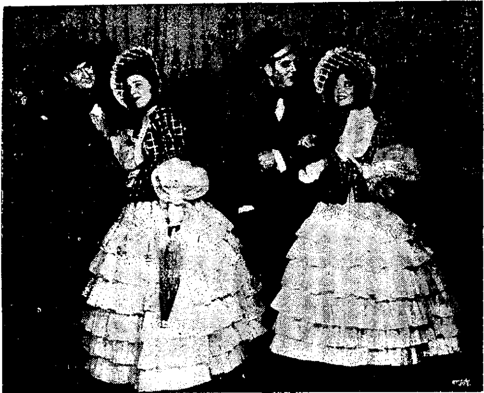
Here's a scene from "Blossom Time," the 23-year-old operetta which will be at the Parkway theater Saturday, Mar. 25. Two performances will be given.