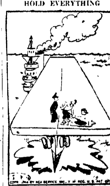
"Do a good job in the corner!"