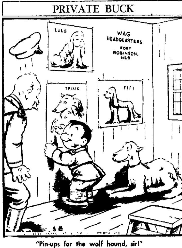
"Pin-ups for the wolf hound, sir!"

He termed the corps "one of the most vital and colorful, yet one of the least publicized branches of our armed forces."