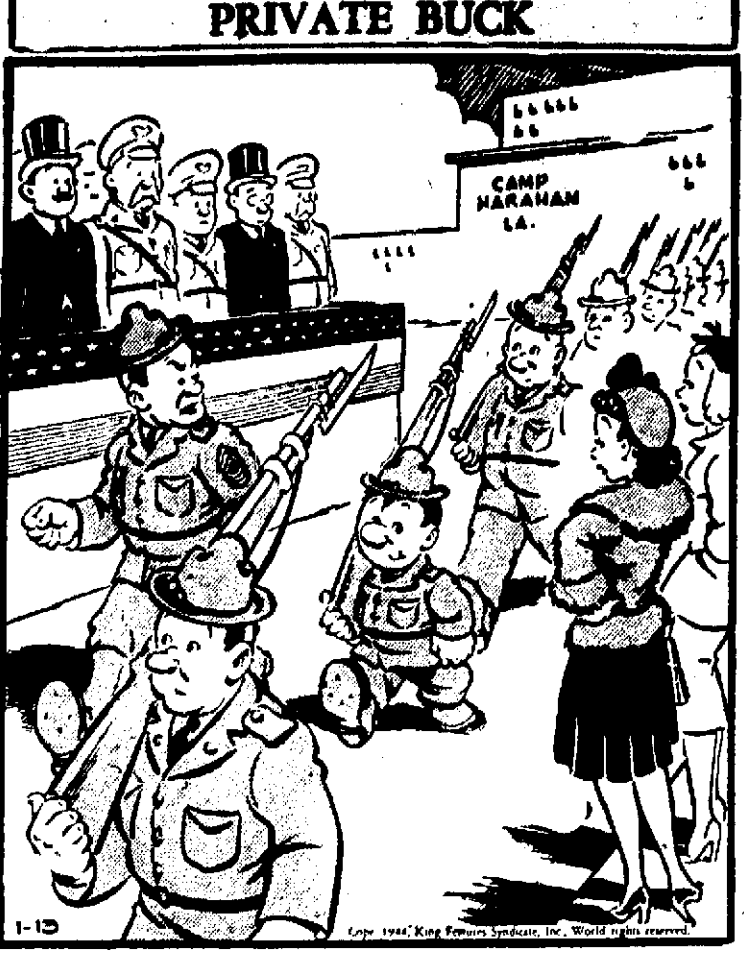
"I said, 'eyes RIGHT,' Buck!"

Six thousand stars are visible to the human eye.