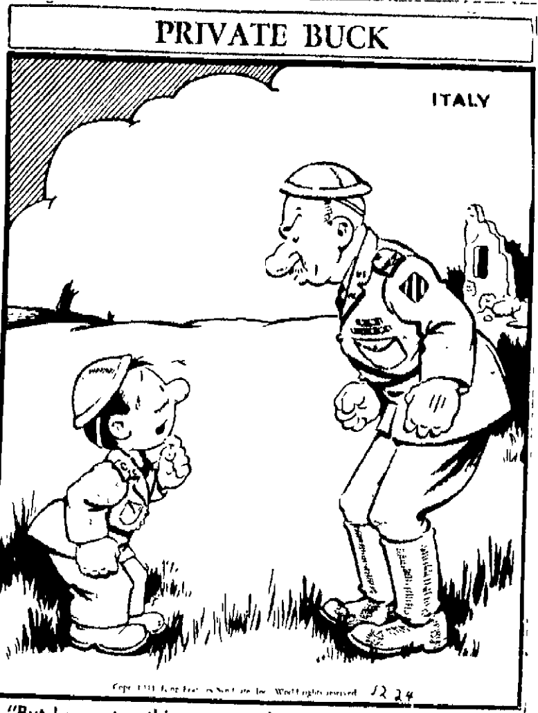
"But I meant nothing personal, sir, when I said the enemy's plans are as plain as the nose on your face!"