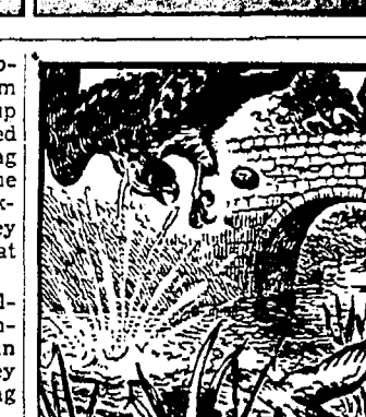
Splashing Stones Saved King-