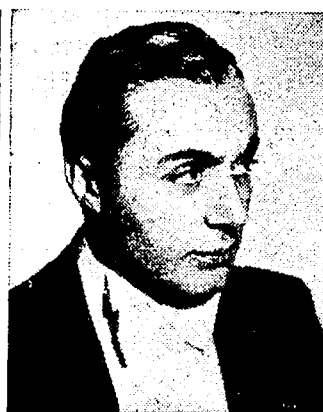
CHARLES BOYER WBBM at 8