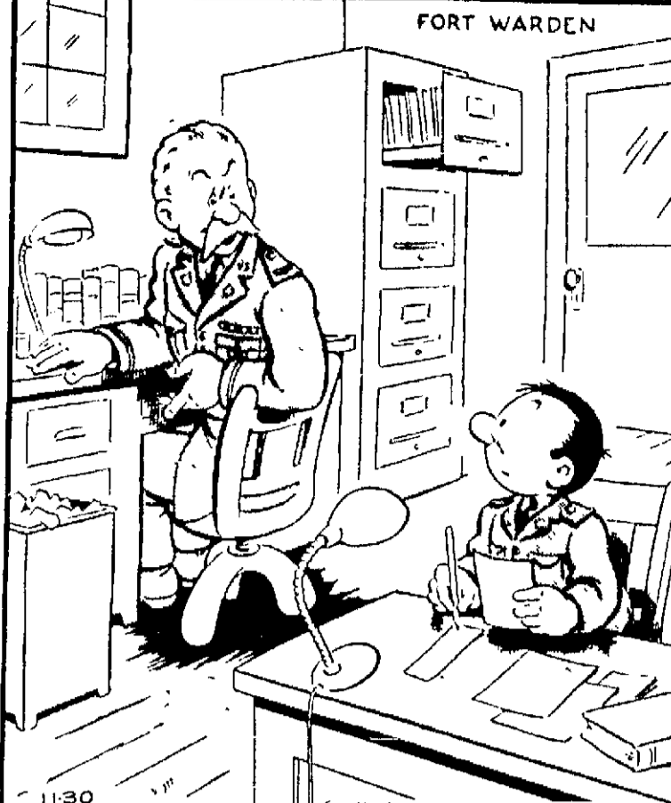
"You don't have to talk in code, Private Buck!"