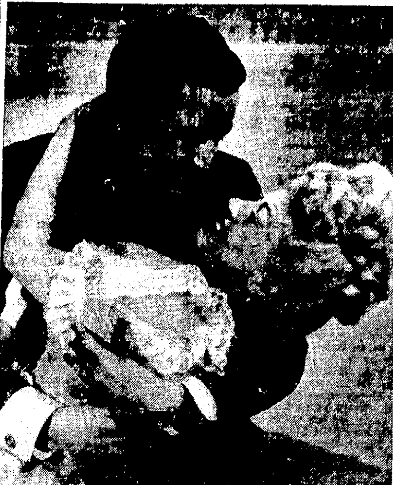
OOOH! BETTY: She's really won Robert Young's heart in their latest co-starring Technicolor musical, the lavish "Sweet Rosie O'Grady," which is showing at the Quilna theatre. Adolphe Menjou is starred with them—and they're saying that la Grable is in rare form—nuff said.