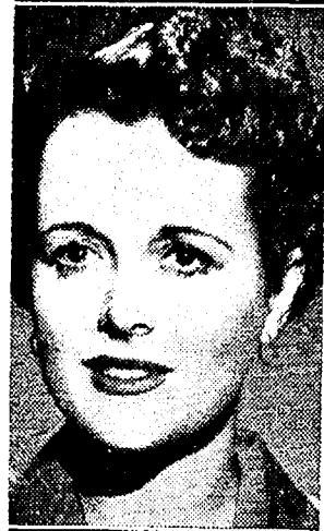
MARY ASTOR WBMM at 9

Drama 7 p. m.—Cavalcade of America (WBA): George Brent in "Burma Surgeon." 8 p. m.—Radio Theater (WBMM): Claudette Colbert, Veronica Lake, Paulette Goddard and Sonny Tufts in "So Proudly We Hail." 9 p. m.—Screen Guild (WBMM): "You Belong to Me," with Don Ameche and Mary Astor.