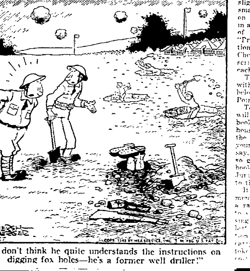
"I don't think he quite understands the instructions on digging fox holes—he's a former well driller!"