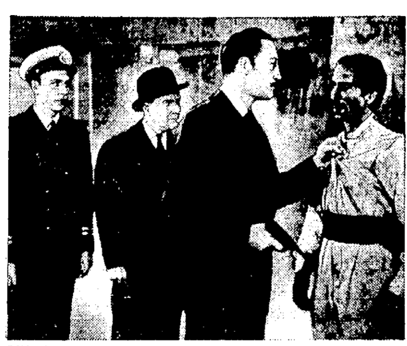
QUILNA ADVENTURERS—Warren William plays the Lone Wolf in "Passport to Suez," currently showing at the Quilna theatre.