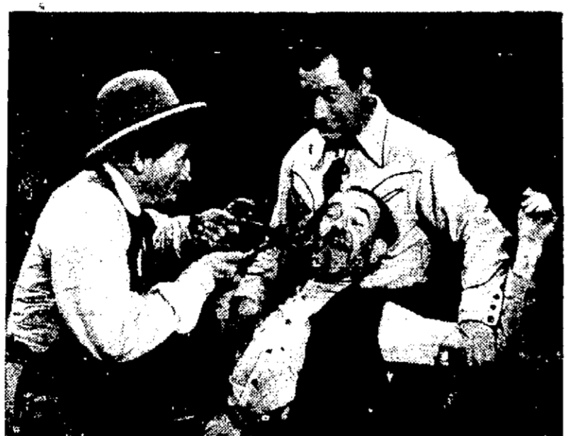
THIS WON'T HURT A BIT—As an oldtime "dentist on horseback," Raymond Hatton garners laughs in "Outlaws of Stampede Pass," Johnny Mack Brown western at the Lyric.