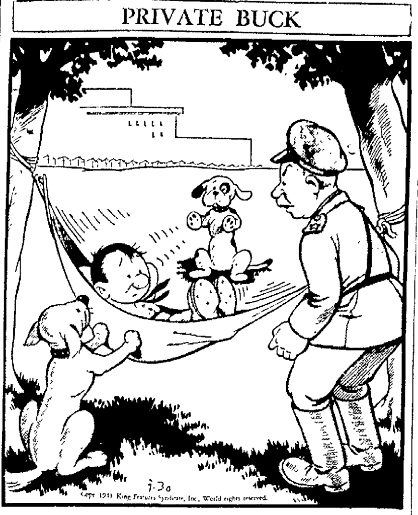
"Private Buck, I don't think you quite grasp the spirit of our dog-training program!"