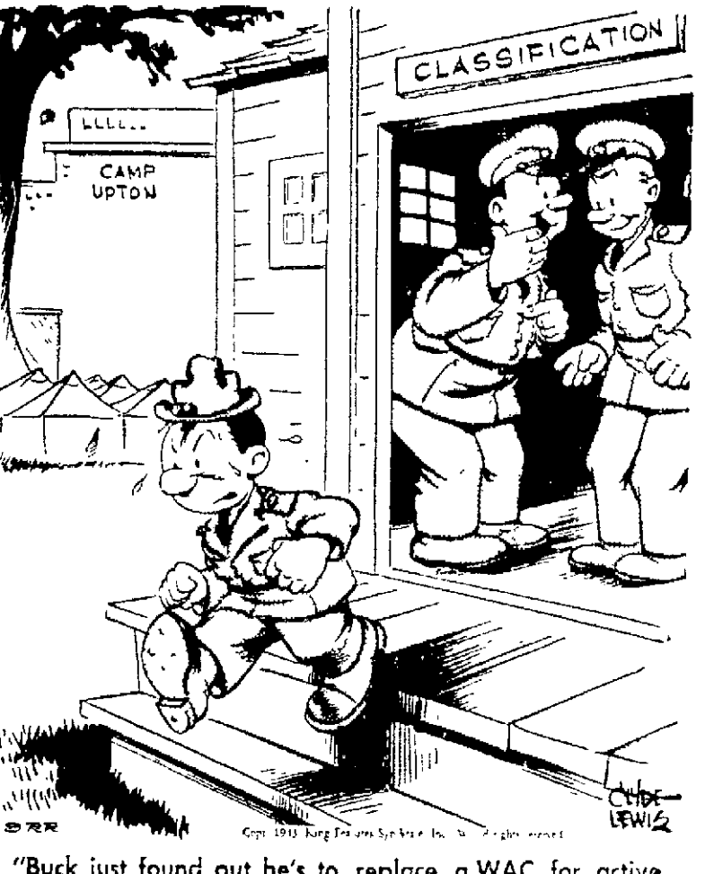
"Buck just found out he's to replace a WAC for active duty!"