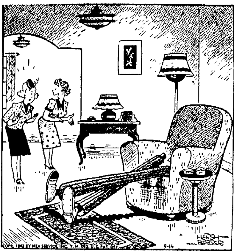
"I got those for my husband's easy chair so I'll have something to fall over in the daytime!"