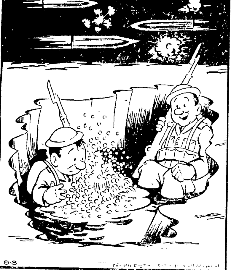
"This is a fine piece to carry seltzer tablets in your pockets"

are urged by the local recruiting personnel to visit the station Friday to determine whether they can qualify. All men are requested to bring letters of recommendation stating facts concerning their experience.