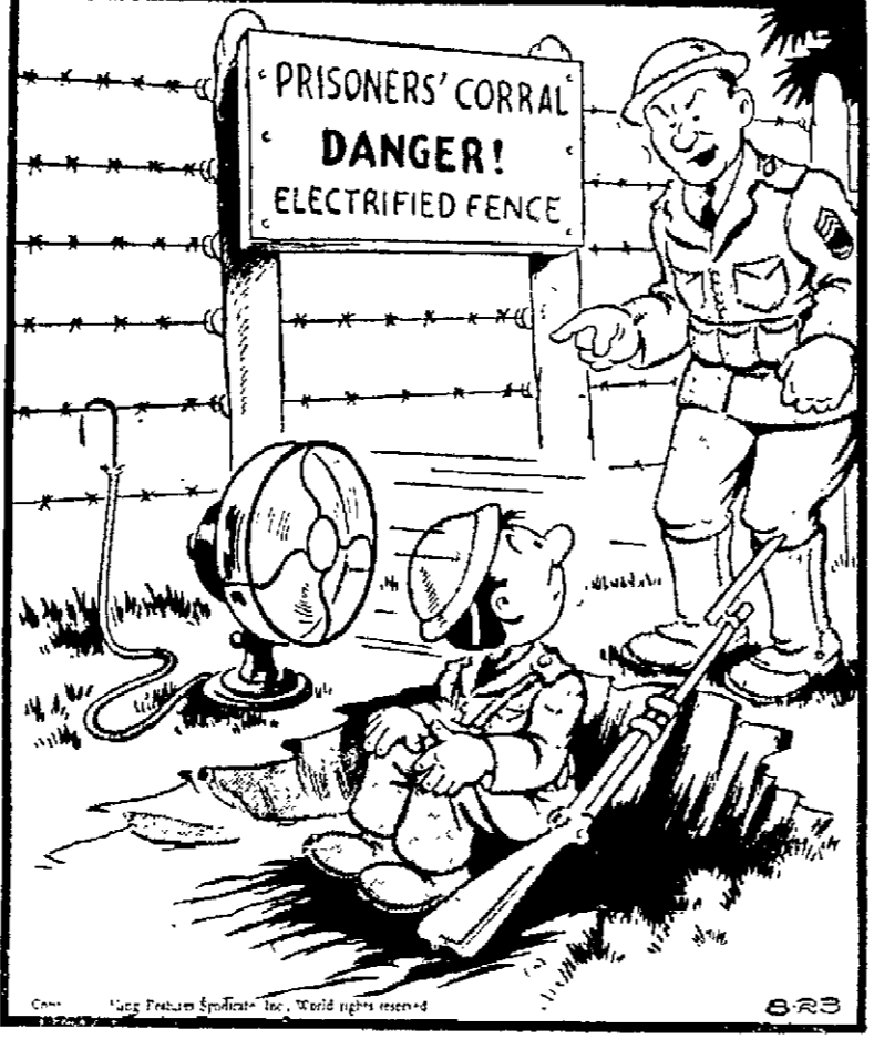
"Kinda stuffy in the Colonel's office, Buck. Mind if I give him his fan back?"