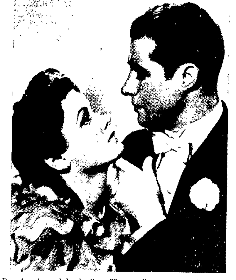
Don Ameche and lovely Gene Tierney discover each other in the current Quilna attraction, "Heaven Can Wait."