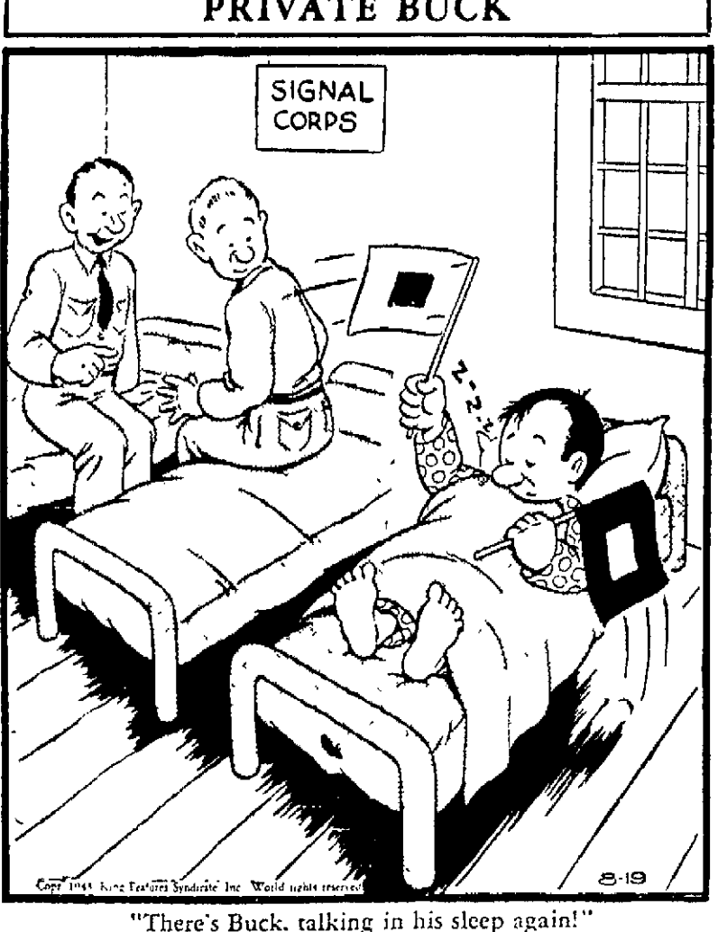
"There's Buck, talking in his sleep again!"