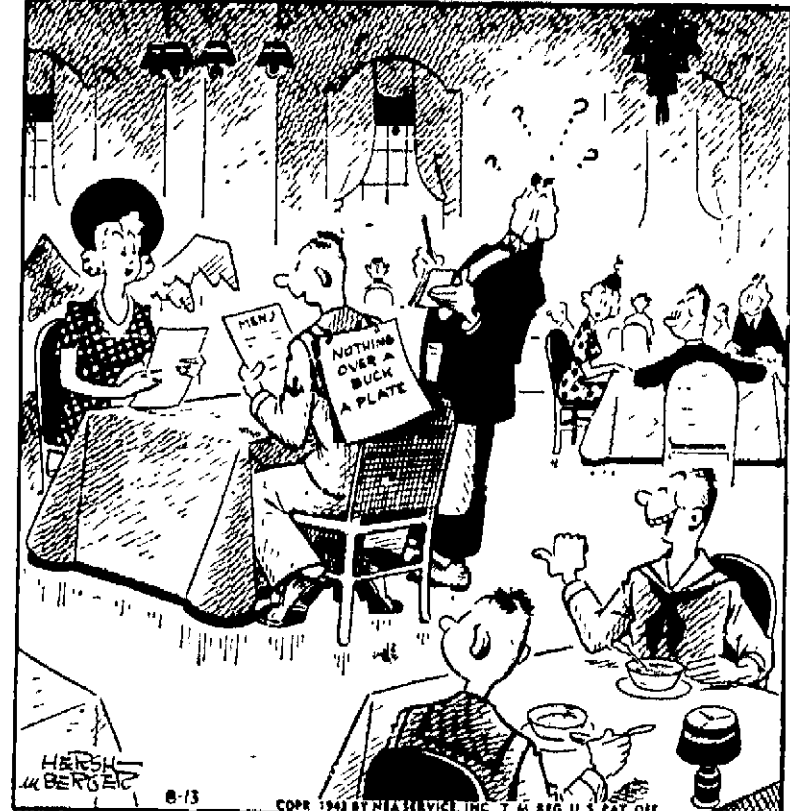
"He's taking no chances—the last time he had her out she ordered lobster!"