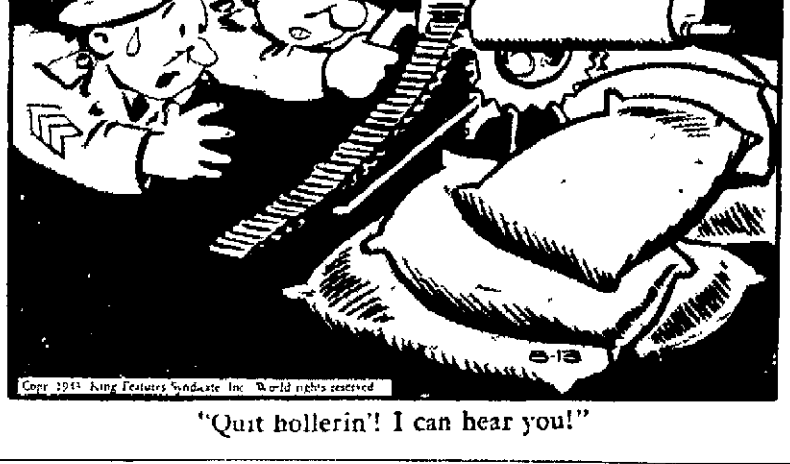
"Quit hollerin'! I can hear you!"