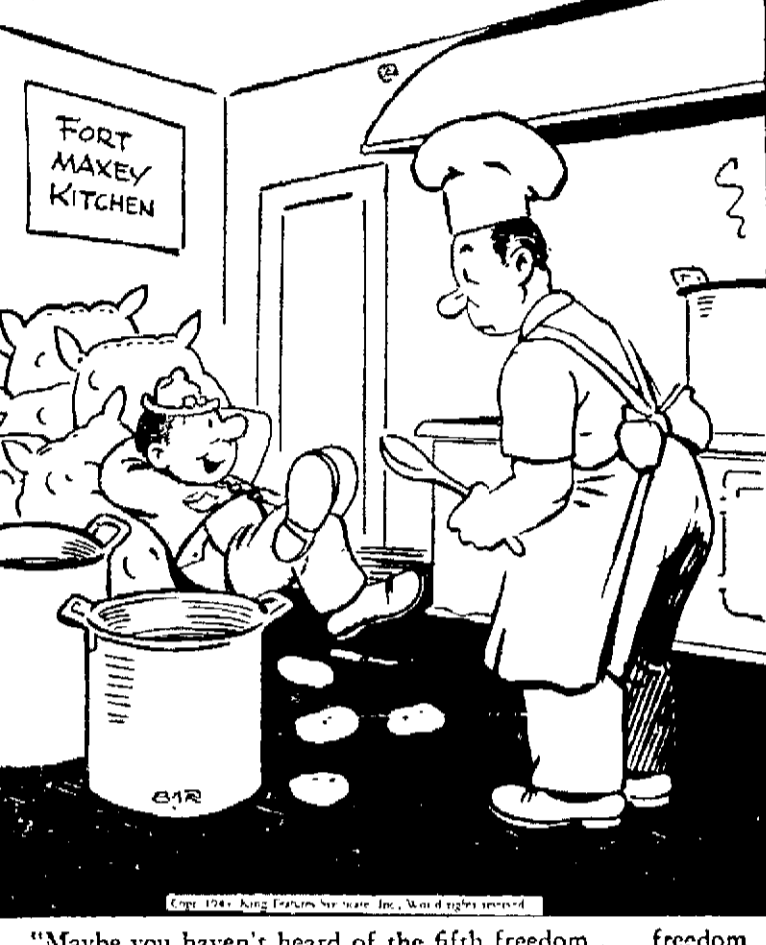
"Maybe you haven't heard of the fifth freedom... freedom from K.P.F."