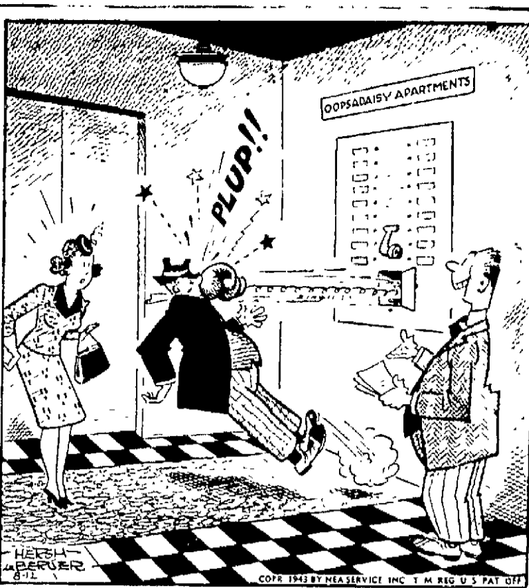
"And for $5 a month extra your apartment gets the use of this anti-bill collector device!"