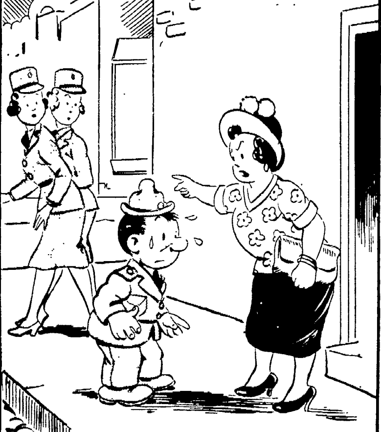
"—and don't try to tell me they were calling you by your Indian name, when they called you, 'Little Fat Wolf!'—"