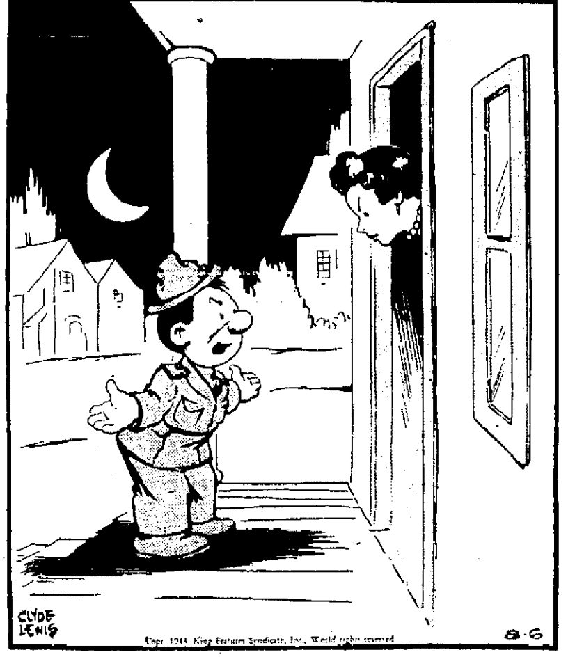
"Reveille ISN'T another girl I have to get back for! It's routine—army routine!"