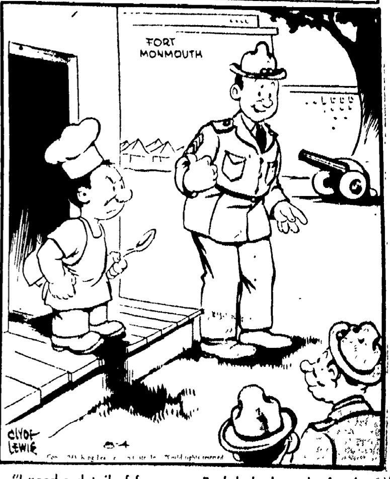
"I need a detail of four men. Buck baked a cake for the Major and we have to deliver it!"