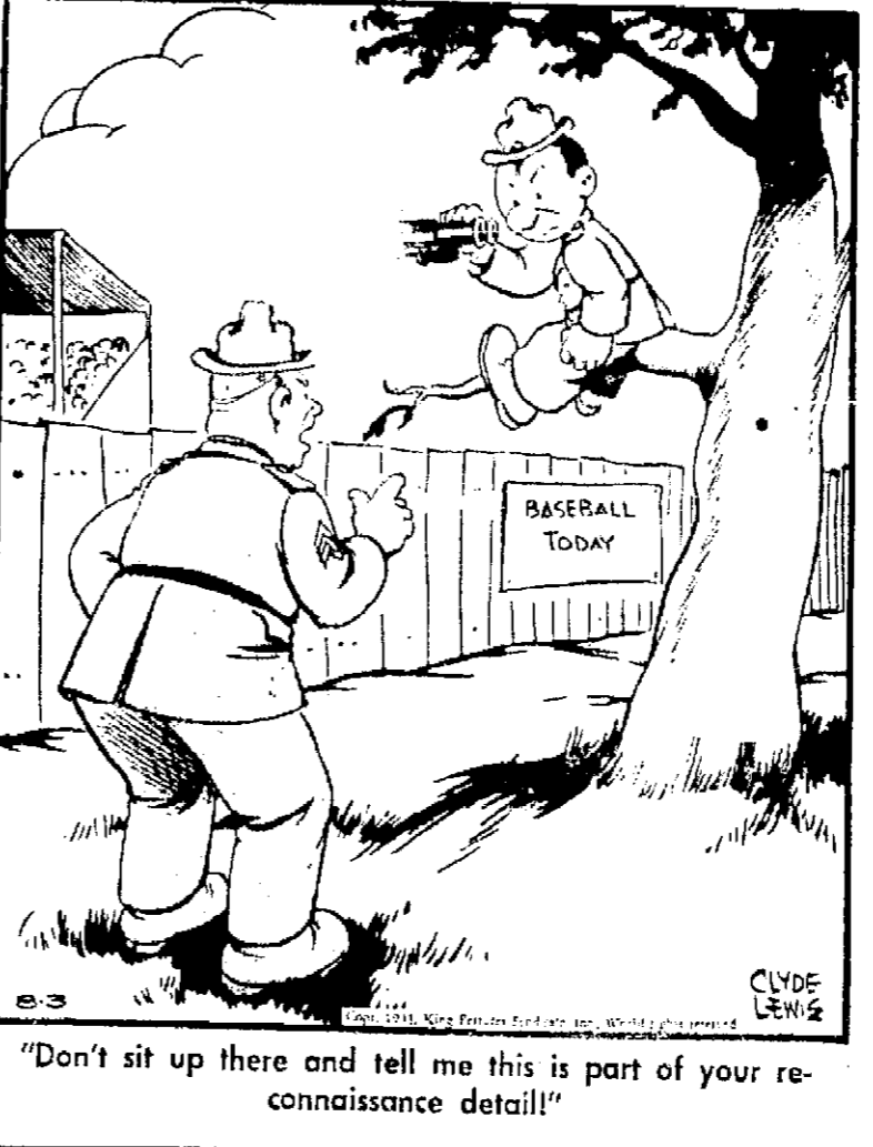
"Don't sit up there and tell me this is part of your reconnaissance detail!"