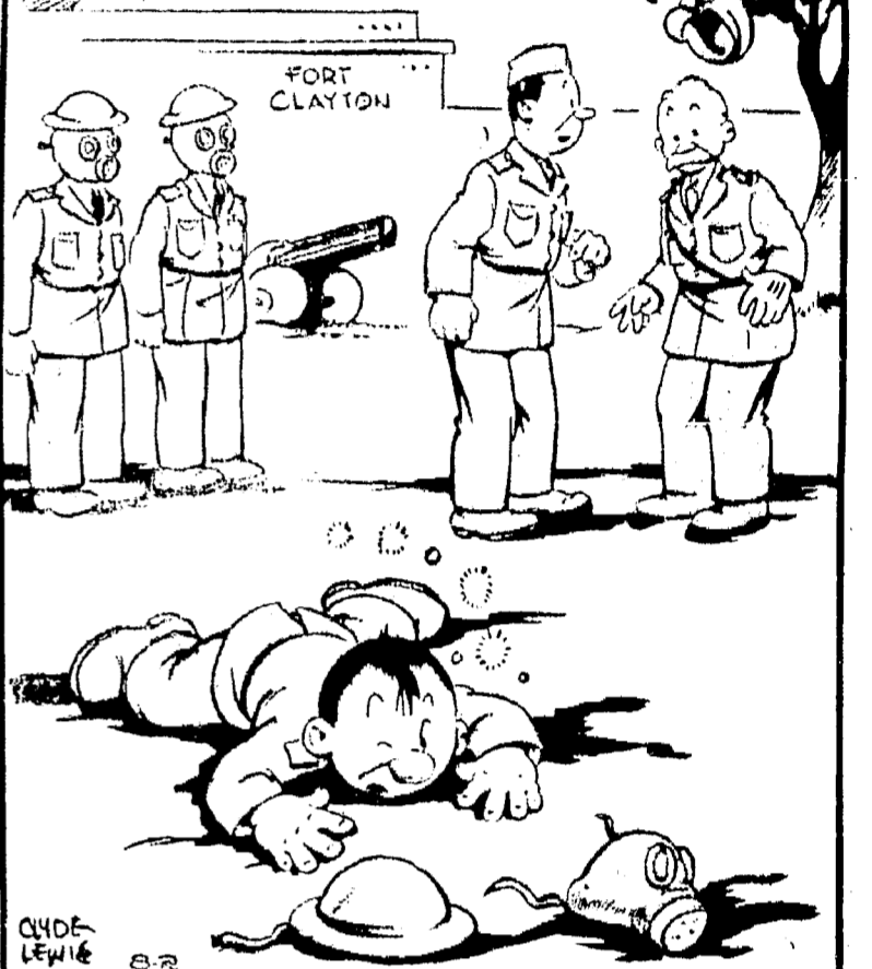
"A case of internal combustion, Sir. He sneezed with his gas mask on!"