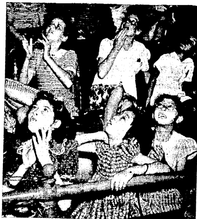
Kids at the circus make with the enraptured eyes and expressive hands as they watch death-defying aerial acts.