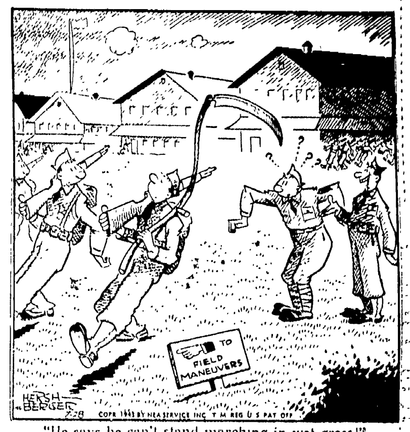
"He says he can't stand marching in wet grass!"