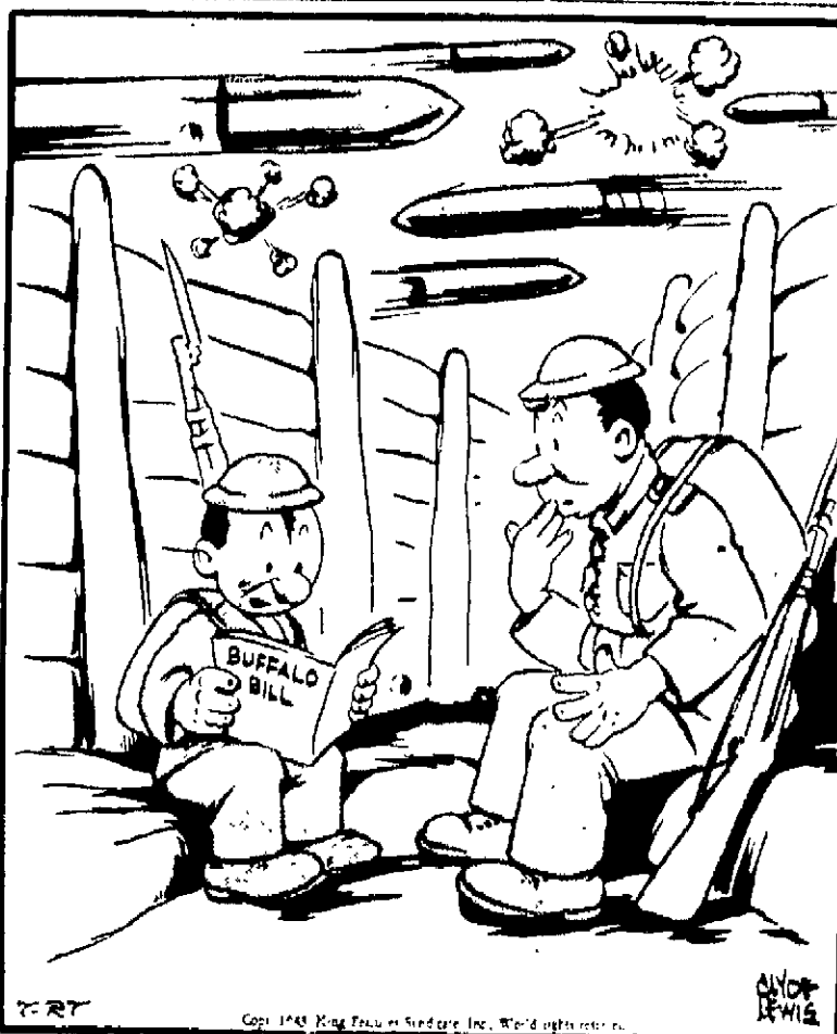
"... and with every crack of his trusty rifle a redskin bit the dust!"