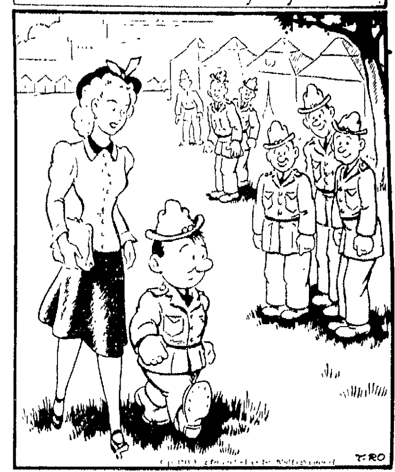
"You seem to be popular here, Buck, the way they all look when you pass!"